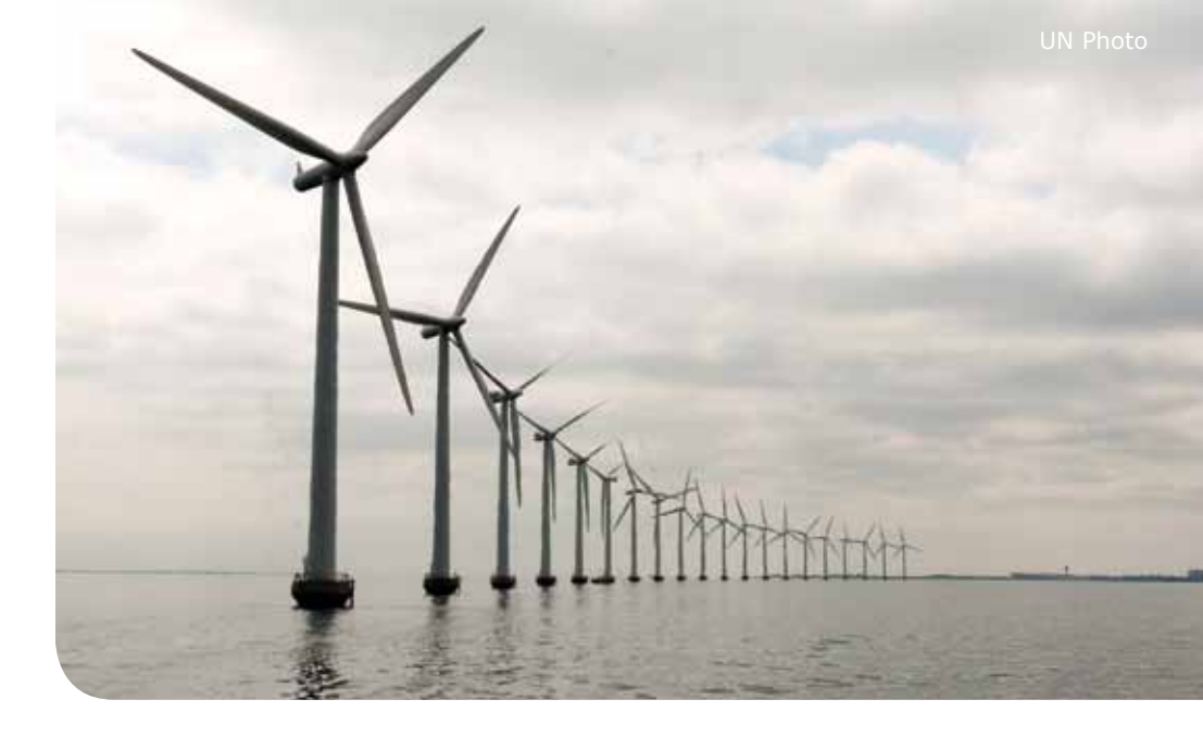
Middelgruden offshore wind farm in Denmark