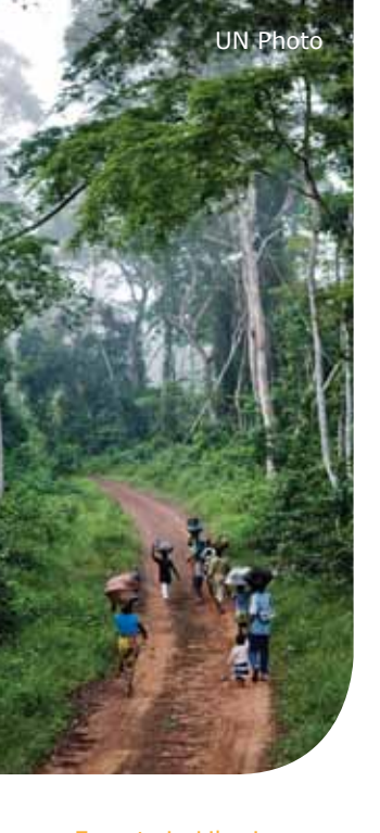
Forests in Liberia